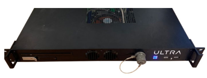
RCMS is an NSA-reviewed and authorized re-key system.